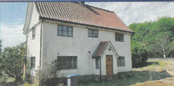
SUFFOLK, Farnham Detached good size four bedroom farmhouse set in a large rural plot. A modern property in need of cosmetic work to create a good sized family dwelling. SUBJECT TO AN AGRICULTURAL OCCUPANCY CONDITION GUIDE PRICE: £400,000 (Ref: C356)