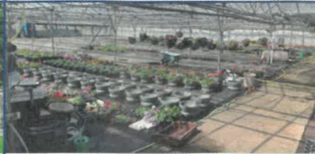
SUFFOLK, Newbourn Opportunity to acquire established garden nursery business with benefit of PP for 3 bed detached house, set in rural location. In total, site extends to approx 0.73 ha (1.8 acres). GUIDE PRICE: £350,000 (Ref: P236)