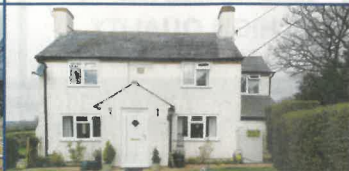
OXFORDSHIRE, Wallingford A detached three bedroom house with garden set in a good sized plot located on the outskirts of the village of Wallingford. SUBJECT TO AN AGRICULTURAL OCCUPANCY CONDITION contained within a Section 52 Legal Agreement. GUIDE PRICE: £540,000 (Ref: C354)