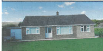
LINCOLNSHIRE, Kirton Holme Detached 2 bed bungalow with 2 garages and large established mainly lawned garden situated in an accessible location in the village of Kirton Holme. SUBJECT TO AN AGRICULTURAL OCCUPANCY CONDITION GUIDE PRICE: £204,000 (Ref: C350)