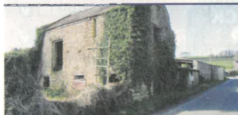
SOMERSET, Stoney Stratton Development opp to convert stone and block barn into detached dwelling situated in rural location. Plot extends in total to approx 0.17 acre. additional land may be available by sep neg. GUIDE PRICE: £325,000 (Ref: P226)