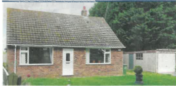
NOTTINGHAMSHIRE, Gilton Detached 2 bed bungalow set in 0.7 hectare (1.5 acres) with garage and general purpose farm building. SUBJECT TO AN AGRICULTURAL OCCUPANCY CONDITION GUIDE PRICE: £210,000 (Ref: C349)