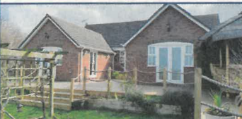
BUCKINGHAMSHIRE, Great Brickhill Detached, modern, well presented, 4 bed farmhouse (chalet bungalow) with attached double garage and extensive gardens set in a rural location. SUBJECT TO AN AGRICULTURAL OCCUPANCY CONDITION GUIDE PRICE: £825,000 (Ref: C358)