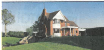
HERTFORDSHIRE, Broxbourne An individually designed six bedroom detached house with large garden and set in a rural yet accessible location. SUBJECT TO AN AGRICULTURAL OCCUPANCY CONDITION GUIDE PRICE: £1,100,000 (Ref: C357)