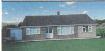
LINCOLNSHIRE, Kirton Holme Detached 2 bed bungalow with 2 garages and large established mainly lawned garden situated in an accessible location in the village of Kirton Holme. SUBJECT TO AN AGRICULTURAL OCCUPANCY CONDITION GUIDE PRICE: £204,000 (Ref: C350)