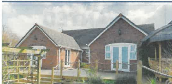
BUCKINGHAMSHIRE, Great Brickhill Detached, modern, well presented, 4 bed farmhouse (chalet bungalow) with attached double garage and extensive gardens set in rural location. SUBJECT TO AN AGRICULTURAL OCCUPANCY CONDITION GUIDE PRICE: £225,000 (Ref: C358)