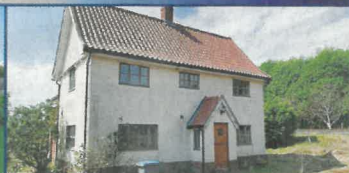
SUFFOLK, Farnham Detached good size four bedroom farmhouse set in a large rural plot. A modern property in need of cosmetic work to create a good sized family dwelling. SUBJECT TO AN AGRICULTURAL OCCUPANCY CONDITION GUIDE PRICE: £400,000 (Ref: C356)