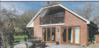
CAMBRIDGESHIRE, Caldecote A detached four bedroom farmhouse (chalet bungalow) with large garden and set in a rural yet accessible location. SUBJECT TO AN AGRICULTURAL OCCUPANCY CONDITION GUIDE PRICE: £510,000 (Ref: C355)

Central Property Sales: 0345 340 5215 www.acorus.co.uk